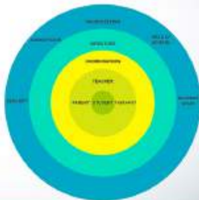
Circles of Support Gateway-Mumbai's Organizational Structure

"(Something special about Gateway is its Open Door Policy where one can approach anyone - PDS, Director, Teacher, Admin, etc. - for any problem & is sure to get a near-instant response." - Team member, anonymous review, May 2014